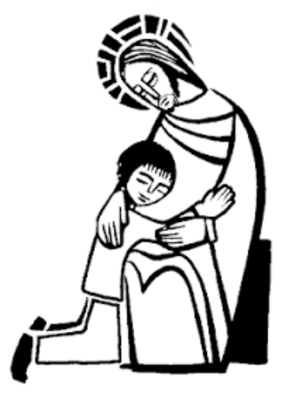
"I will not leave you orphans"